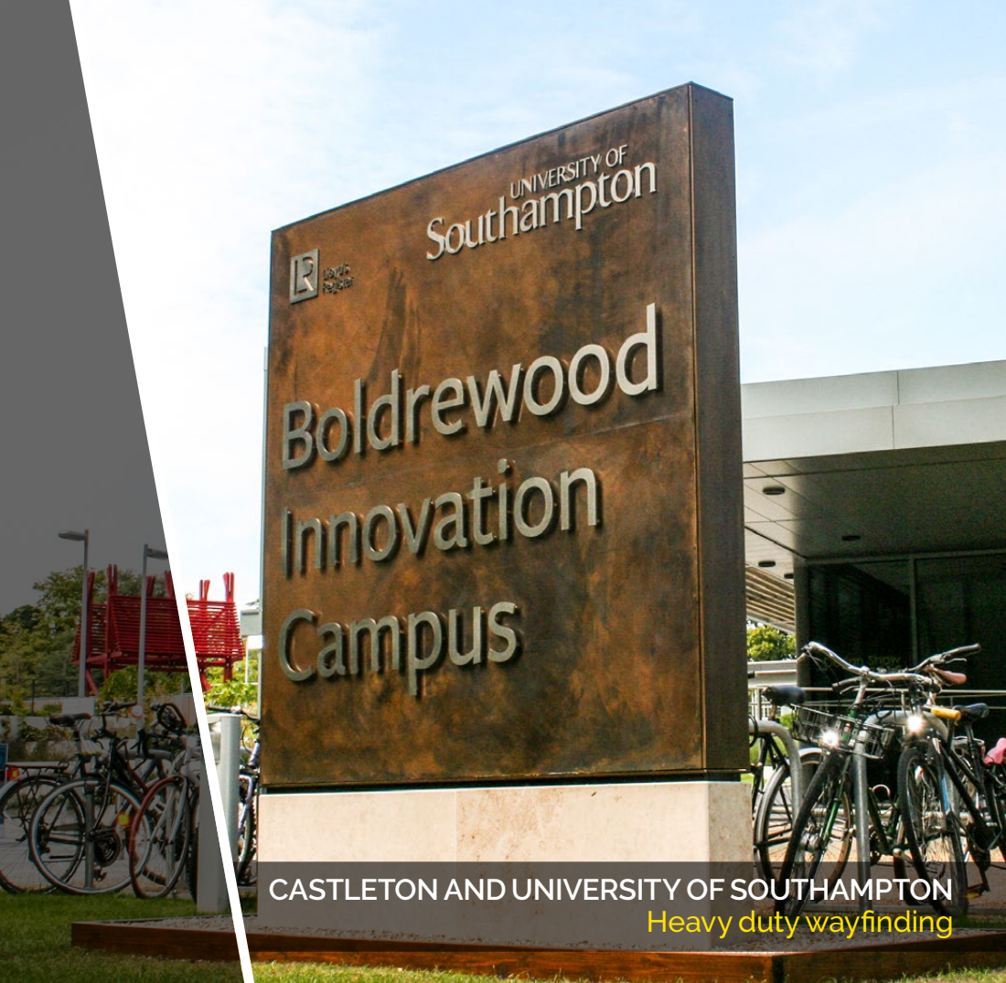
CASTLETON AND UNIVERSITY OF SOUTHAMPTON Heavy duty wayfinding